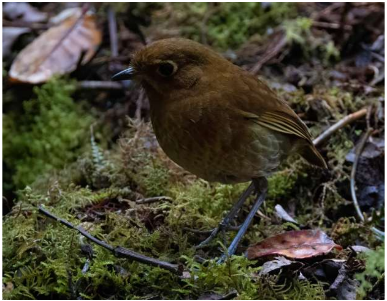
Muisca Antpitta Grallaria rufula ®.