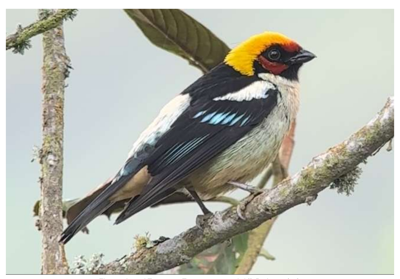
Flame-faced Tanager, Tangara parzudakii.

January 19, Day 3: Chicaque. An early departure will find us heading to a "classic" birding destination near Bogotá. Chicaque is the best place to enjoy the cloud forests of the western slope of Eastern Andes. Privately owned, it is a reserve that protects over 300 Hectares (740 Acres) of Cloud Forest. It has a convenient trail that goes from 2,600 meters (8530 feet) down to 2,100 meters (7980 feet), allowing sight of birds related with each ecological level. One of the main attractions of Chicaque are the mixed species flocks which can always bring exciting moments! Some of the species reported in previous tours are Black Inca (Endemic), Goldenbellied Starfrontlet (Endemic), Wiskered Wren (Near-endemic), Sharpe's Wren (Near-endemic. Endemic subspecies), Moustached Brushfinch (Near-endemic), Southern Emerald Toucanet, Chestnut-crowned Antpitta, Brown-billed Scythebill, Ash-browed Spinetail (Endemic subspecies), Variegated-Bristle-Tyrant, Rufous-breasted Flycatcher (Near-endemic), Rufous-tailed Tyrant as well as Blue-and-black, Grass-green, Beryl-spangled, Flame-faced, Metallic-green and Fawn-breasted Tanagers.