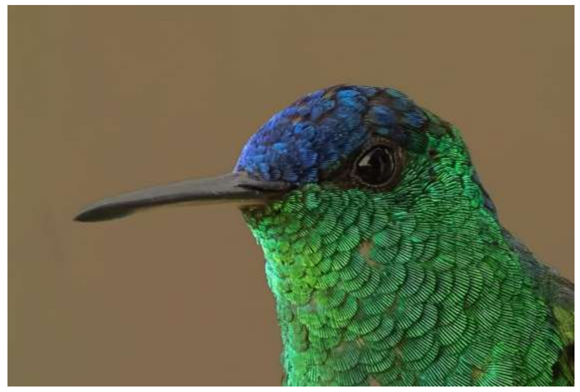
Indigo-capped Hummingbird, Saucerottia cyanifrons.

Our seven-day trip will be based the heart of Eastern Andes. We will be birding the Bogotá plateau and the west slope of Eastern Andes. It 's a privilege for Bogotá to have easy access to these different areas. Along with the impressive birds, you will be amazed also with the landscape, vegetation, climate, and the changes as we reach different elevations. We are expecting to go birding in high altitude Wetland, high Andean Forest (dwarf forest), premontane (cloud forest) and even tropical dry forest.