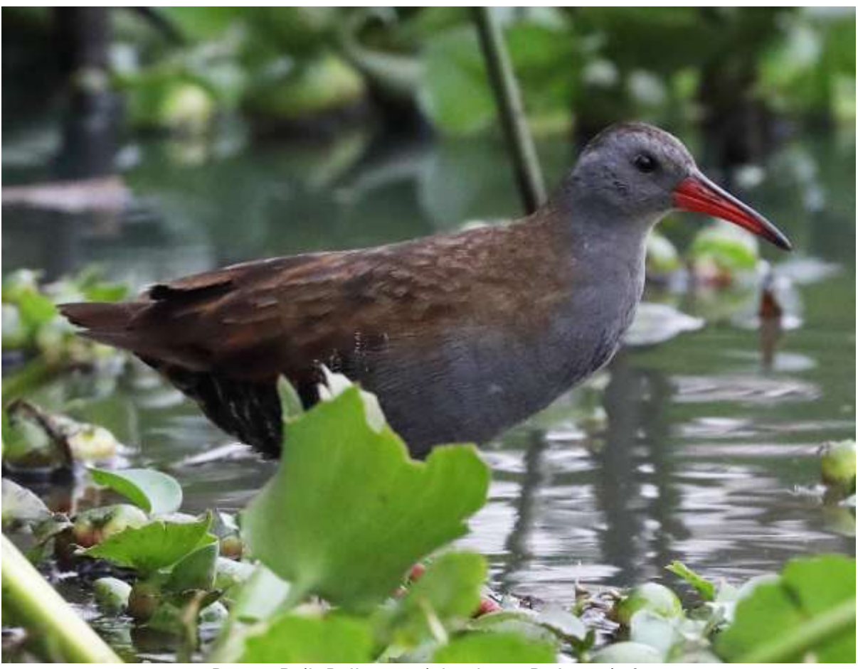
Bogota Rail, Rallus semiplumbeus. D. Ascanio ®.

Please note that this tour is part of our Colombia Trilogy, and it can be taken in combination with these two superb tours: Undiscovered Eastern Colombia: Birding Secrets of the White Sands of Inirida, January 2-10, 2026 Birding Adventure in Colombia's Llanos: Hato Aurora & Reserva Casanare, January 10-17, 2025