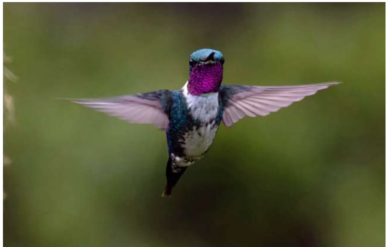
White-bellied Woodstar, Chaetocercus mulsant.

January 18, Day 2: Florida wetland, Tabacal lagoon and Enchanted Garden. An early departure (05:00 a.m. approximately) will allow us to reach the Florida wetland in time to search for the secretive (Endemic) Bogota Rail. Also, Andean Duck, Masked Duck, Spot-flanked Gallinule (Endemic subspecies), Silvery-throated Spinetail (Endemic), Subtropical Doradito (Rarely seen), Yellow-hooded Blackbird (Endemic subspecies) and Rufous-browed Conebill (Near-endemic). After breakfast, we will head to the Tabacal Lagoon, a wetland located at lower elevation where we have found higher bird richness including Moustached Puffbird, Barcrested Antshrike (Near-endemic. Endemic subspecies), Blue-lored Antbird (Near-endemic), Plain Antvireo (Endemic-subspecies), Rusty-breasted Antipitta, Stripe-breasted Spinetail (Near-endemic), Ash-browed Spinetail (Endemic subspecies), White-bearded Manakin (Endemic subspecies), Scale-crested Pygmy Tyrant, Black-bellied Wren (Endemic subspecies) and Speckle-breasted Wren (Endemic subspecies). Other passerine species include Rufous-naped Greenlet (Near-endemic), Velvet-fronted Euphonia (Endemic), Rosy Thrush-Tanager (Endemic subspecies), Orange-billed Sparrow (Endemic subspecies), Black-headed Brushfinch (Near-endemic), Buff-rumped Warbler (Endemic Subspecies), Gray-throated Warbler (Near-endemic), Crimson-backed Tanager (Near-endemic), Bay-headed, Blue-necked Tanager and Plain-colored Tanagers.