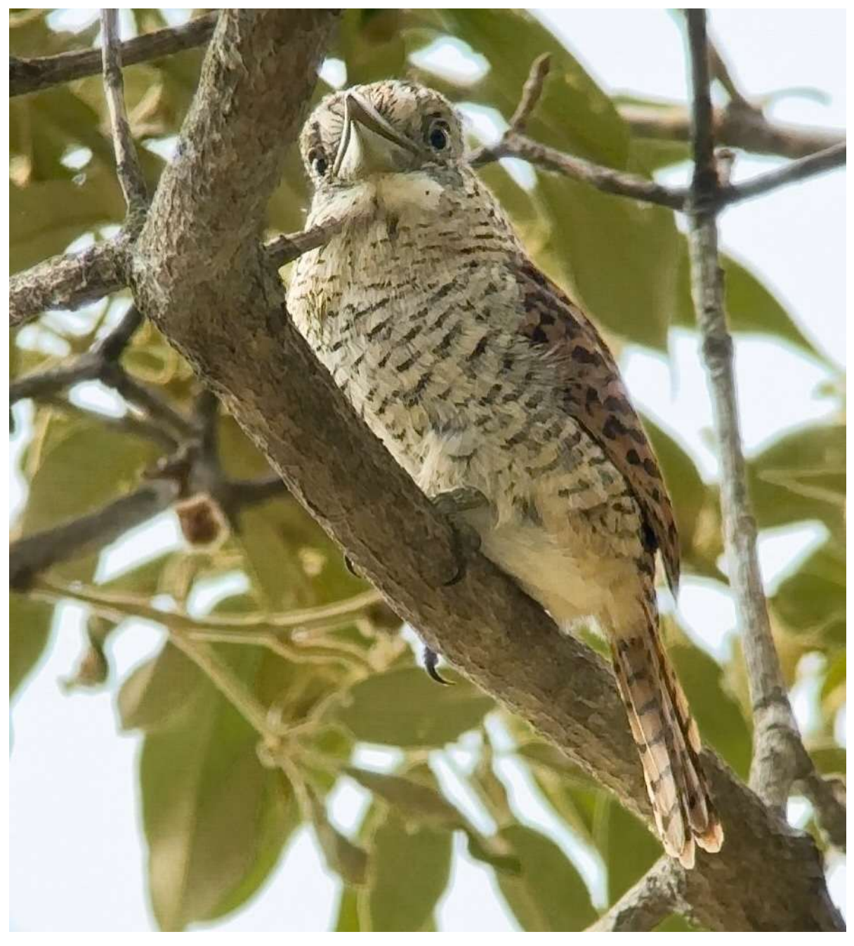
Barred Puffbird, Nystalus radiatus.

January 20, Day 4: Los Cactos Reserve. After an early breakfast we will head to Los Cactos Reserve, a family-owned property. In contrast to the previous locations, here the dominant ecosystem is Tropical Dry Forest, a biome that is probably more threatened than any other rain forest type. Los Cactos is located in the Magdalena Valley foothills of the Eastern Andes (West of Bogotá). Martha and Alain, the owners, are always happy to receive visitors and prepare a delicious lunch to be enjoyed by hummingbird and fruit feeders. Despite much of the deforestation in the past, the reserve has experienced forest recovery and thus, it has become a magnet to forest understory birds such as tyrant-flycatchers and antbirds. Some of the target species previously recorded are Colombian Chachalaca (Endemic),